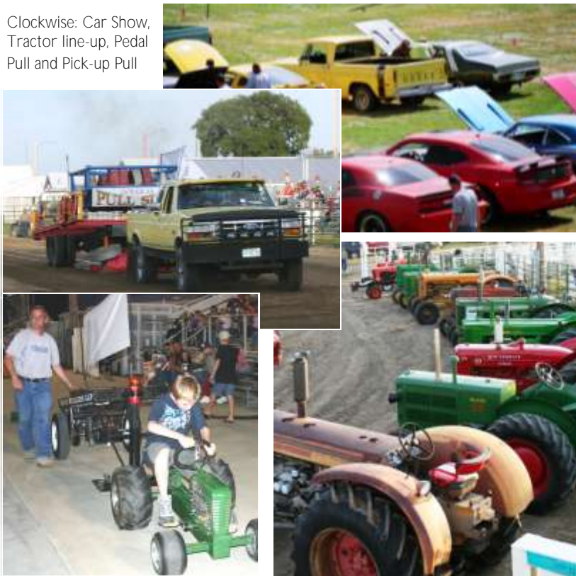
Clockwise: Car Show, Tractor line-up, Pedal Pull and Pick-up Pull

The second annual MonDak Harvest Fest was a success for the Ag Committee on August 22. It was a bright, sunny afternoon for the Show and Shine car show and participation was up with a total of 36 vehicles on display.